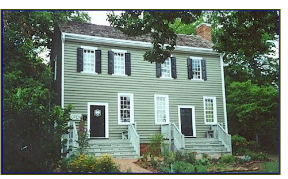
The Eagle Tavern, Watkinsville

Books and pamphlets featuring the seven counties of Barrow, Clarke, Jackson, Madison, Oconee, Oglethorpe, and Wilkes are marked with a pink "Local" spine label.